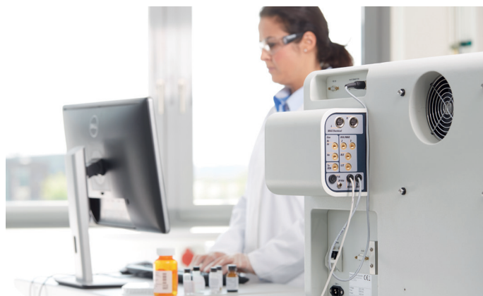
Figure 2. Thermo Scientific MultiValve Control Module.

Each analytical circuit can accept its own autosampler and be configured and automatically switch between the independent analytical setups to increase sample throughput and maximize system up-time. In this way, the system copes effortlessly with the wide array of laboratory requirements such as accuracy, day to day reproducibility, and high sample throughput. The MVC Module also ensures lower helium consumption (used as carrier gas) by switching from helium to nitrogen or argon gas, when the instrument is in Stand-By Mode. Therefore, the cost of analysis is significantly lower.