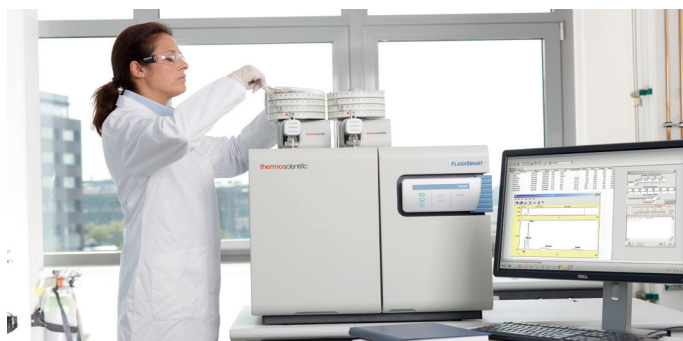
Figure 1. Thermo Scientific FlashSmart Analyzer.

The Thermo Scientific™ FlashSmart™ Elemental Analyzer (Figure 1) is equipped with two totally independent furnaces, allowing the installation of two analytical circuits that are used alternatively and fully automated through the Thermo Scientific™ MultiValve Control (MVC) Module (Figure 2).